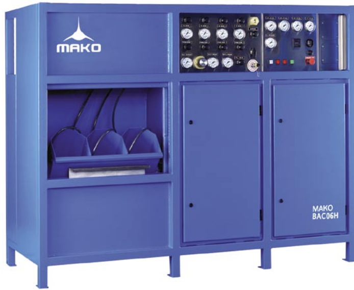
Breathing Air Center