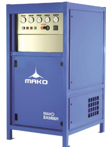
Breathing Air Module